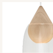
Natural / Transparent

Crafted from solid pine wood, Liuku Pendant leaves its focus on the simple silhouette. The Liuku Pendant collection consist of two base shapes 'Ball' and 'Drop' with an additional hand-blown glass shade. The minimalistic design makes the Liuku Base ideal both hanging as a single pendant, aligned or in decorative clusters for both residential and commercial decor.