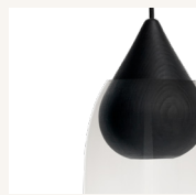
Black / Transparent