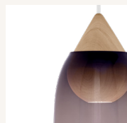
Natural / Violet Gradient