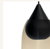
Black / Smoked