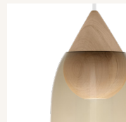
Natural / Smoked